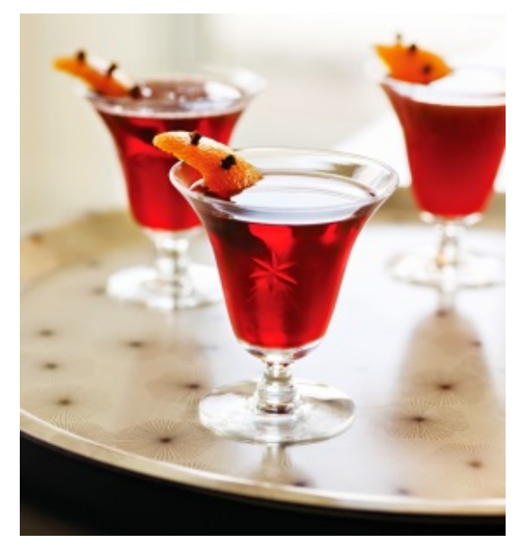
Christmas Punk from Imbibe Magazine

You don't have to reinvent the cocktail to provide your guests with memorable Holiday themed libations. Simply use great existing recipes and give them festive names. The following examples are easy to make using common ingredients: