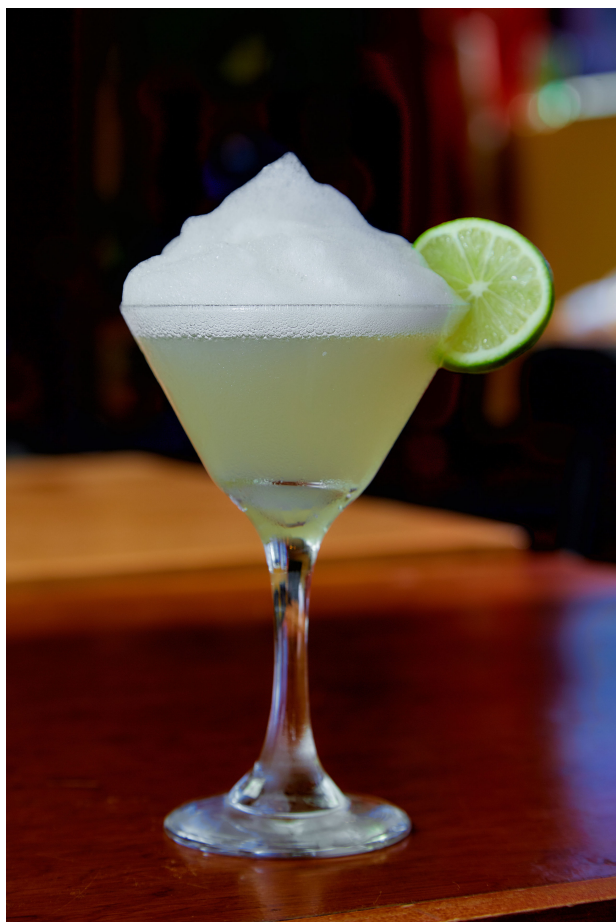
Margarita #2 with Grand Marnier