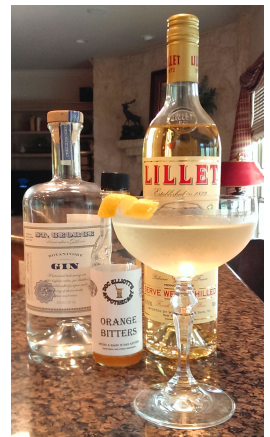
Dry Martini with Lillet